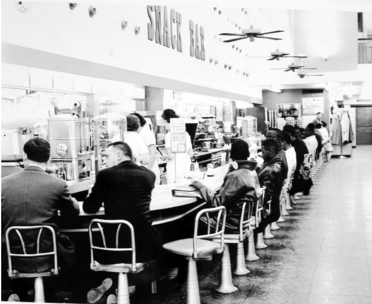
1963 Sit in at G.C. Murphy Co. 8 Broad Street - Rome, GA